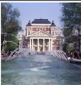
The National Theatre