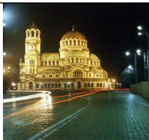
St. Alexander Nevski Church