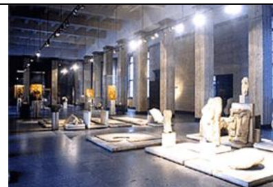
The National History Museum