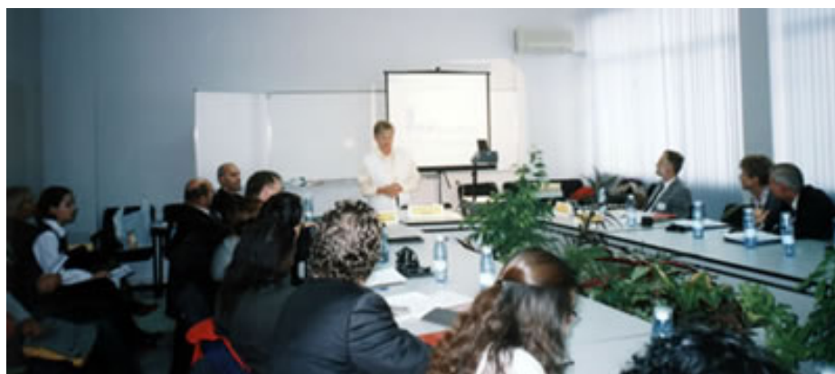
Pictures of the 2 nd International Conference on Comparative Education in Teacher Training Sofia, Bulgaria, October 2003